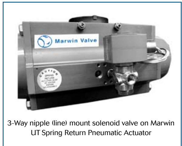
3-Way nipple (line) mount solenoid valve on Marwin UT Spring Return Pneumatic Actuator